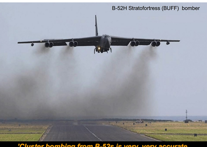
Cluster bombing from B-52s is very, very accurate The bombs always hit the ground' - US Air Force