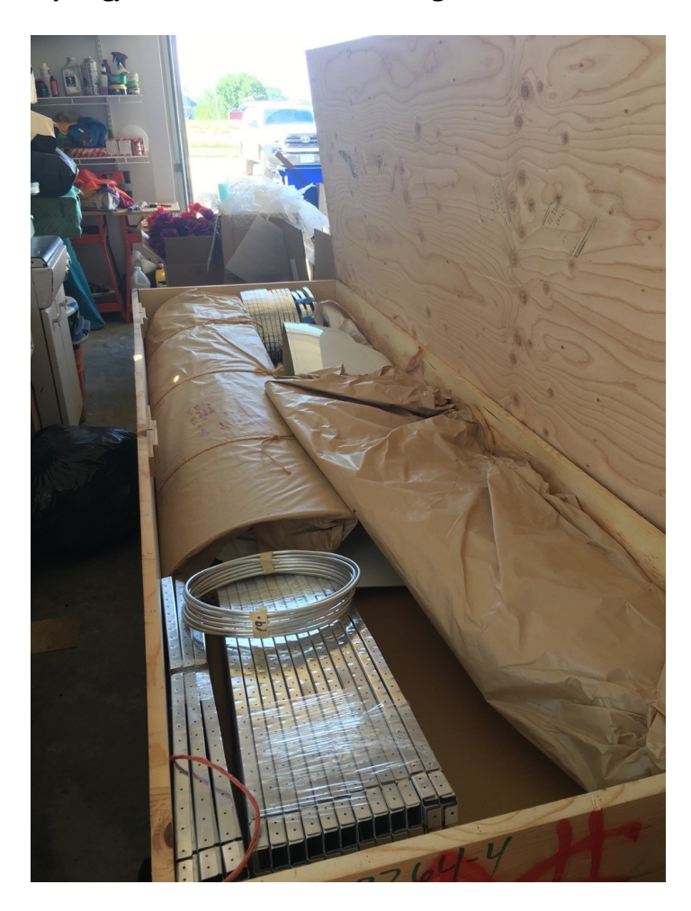
For Sale: Vans RV-9A Completed Empennage built with Synergy Air and Standard Build Wing Kit

My father loved working on this but he passed away before he could complete the plane. The empennage was built with the assistance of Synergy Air and was signed off by Wally Anderson. Empennage includes rudder, vertical, horizontal and both elevators. See pictures attached. The standard build wing kit is still in its original shipping crates. The empennage kit was delivered in 2009 and the wing kit in 2010. Diagrams, instructions and tools included. This is a great opportunity to get a head-start on an RV-9A at a steep discount. We are asking $7500 for the package. We are not interested in separating out the kits. Buyer pays shipping or pick-up. Serious offers only. Located near Centerville, Iowa. Contact me at kirstensaunders@uchicago.edu.