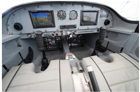
RANS S-19 inside