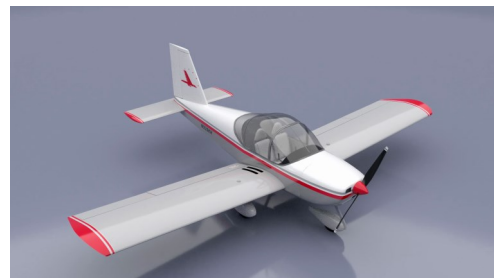
RANS S-19 Paint Rendering

You can get your ticket at https://www.eaa72raffle.org/